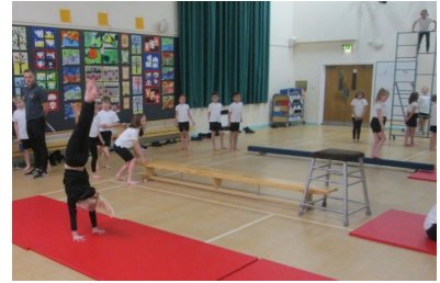
Gymnastics in Year 4