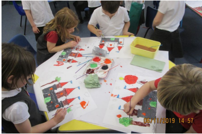
Fantastic artwork in Year 1

We have had a great 1st week back after the half term break. It has been great to see so many interesting things happening across school and children so engaged.