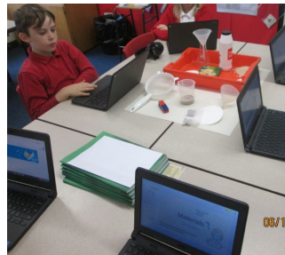
Researching and experimenting with materials in Year 5