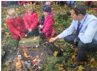
Toasting marshmallows in Forest Schools in FS2