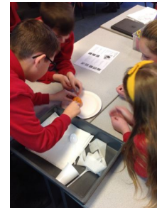
Demonstrating the mummification process in Year 6

Our Twitter presence is developing nicely! This is where we post things that are happening across school. We shared some in assembly today from Early Years, Year 1, Year 3 and Year 5.